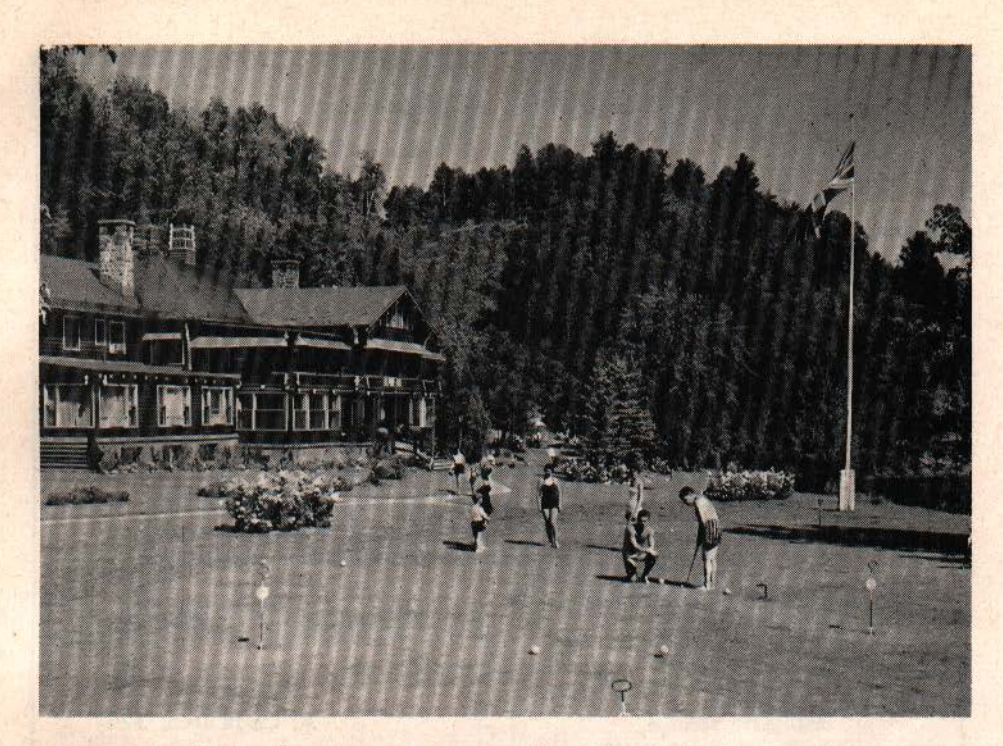
The Alpine Inn, Canada's resort Paradise in the heart of the Laurentian Mountains.