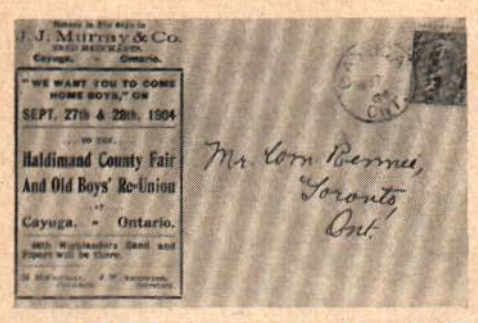
FIG. 13—Cover advertising a small local fair scarce. Note pipe band from Toronto as special attraction. Design in black. (Sharpe)

wild beast shows and circuses, notably that of the famous P. T. Barnum. Those were the days when General Tom Thumb was one of the principal attractions. He weighed 15 pounds and was only 28 inches tall.