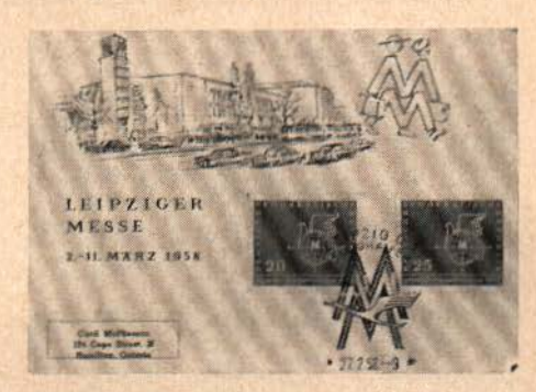
FIG. 15—An interesting cover advertising the world-renowned Leipzig Fair in Germany. Design in brown; other marking in black. (Cecil Mc-Pherson collection)

It should be mentioned here, perhaps, that during the years 1879-on the C.N.E. was known by various names. It has not been possible for me to assemble an accurate list of what might be termed its official names from time to time. Nor have I been able to compile a worthwhile list of 'unofficial' names used. Slightly different, sometimes quite different, names were used from time to time by merchants on the envelopes advertising it. *