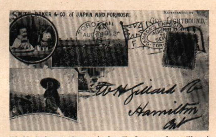
FIG. 10-A nice cover in several colors. The first or oval type (Sharpe)