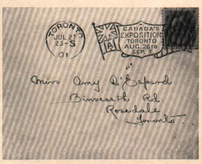
FIG. 11—The second or shield type (Sharpe)