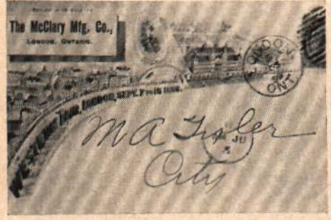
FIG. 14—A well known annual fall fair. Design in black. (Sharpe)

dance." By Newfoundland Jubilees was meant the Cabot issue of 1897, which not only commemorates the 400th "Anniversary of the discovery of Newfoundland by Cabot, but the 60th year of the reign of Queen Victoria." Other such philatelic shows were held at the 'Ex' and will be mentioned later.