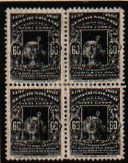
Scott #C4 Cat. $15,000; Sold $17,000

Write for free illustrated catalogues of future attractive lots being offered through Harmer's Auctions.