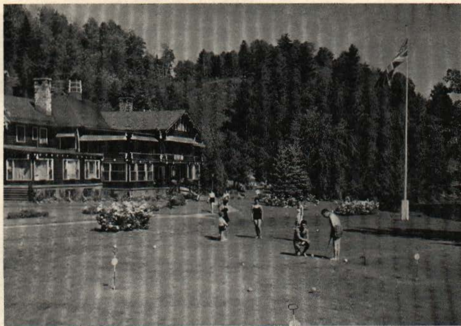
The Alpine Inn, Canada's resort Paradise in the heart of the Laurentian Mountains.