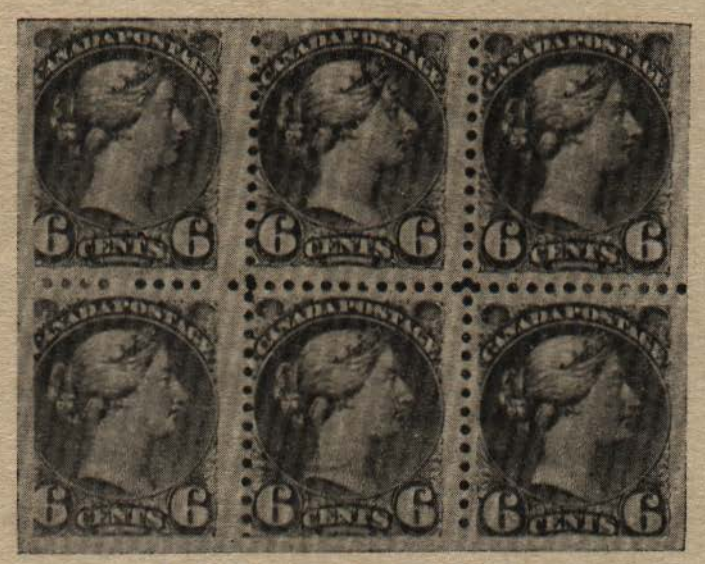
5¢ Re-entry on 6¢ Small Queen

Journal of the British North America Philatelic Society